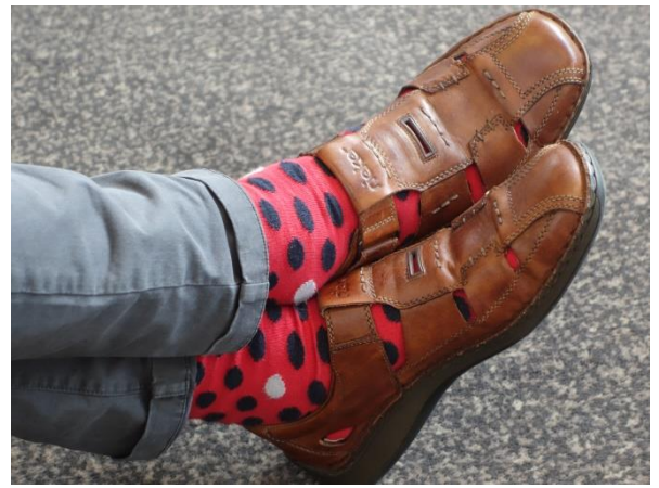
Seen at our probus meeting.