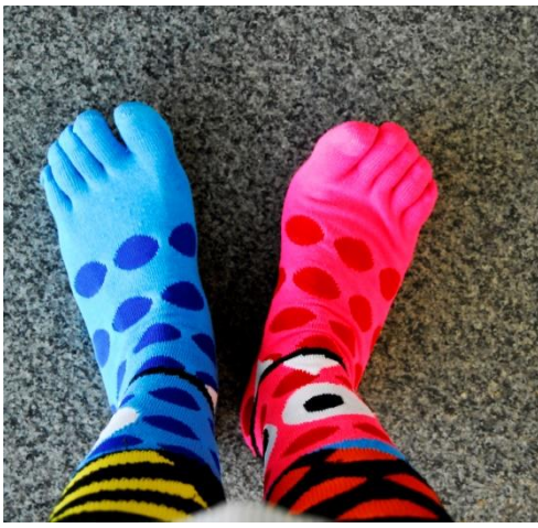
Seen on the internet.