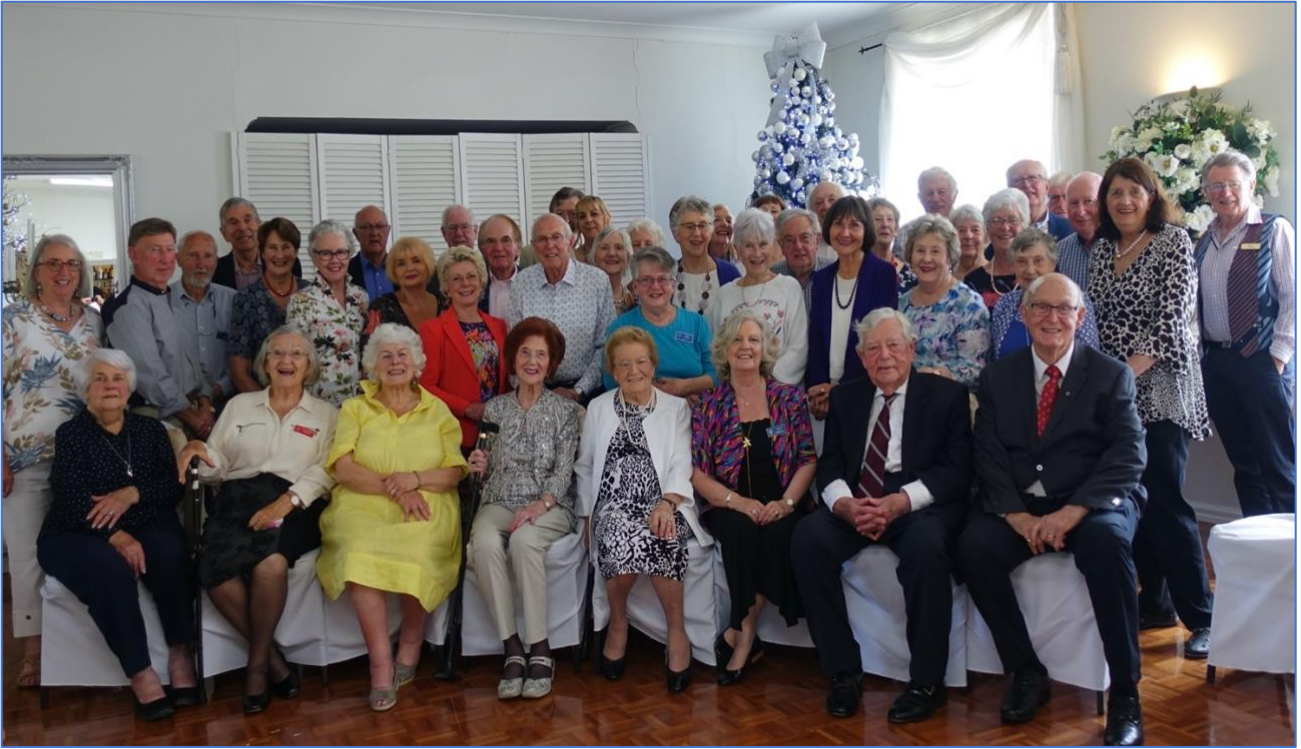
MT ELIZA PROBUS CLUB and GUESTS on the occasion of the Club's Christmas lunch at Norwood House