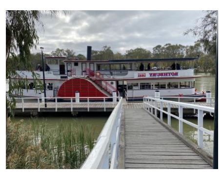
Paddle steamer of the past