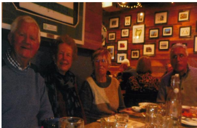
Inside the Irish Pub

'The Dubliners', Irish pub on Octavia Street, Mornington was enjoyed by several members. The atmosphere was good with a great Irish singer. Ploughman's Lunch was enjoyed with good drinks available. A recommendation is to share the large platters!