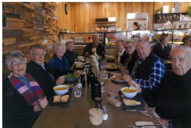
At Café 13/83