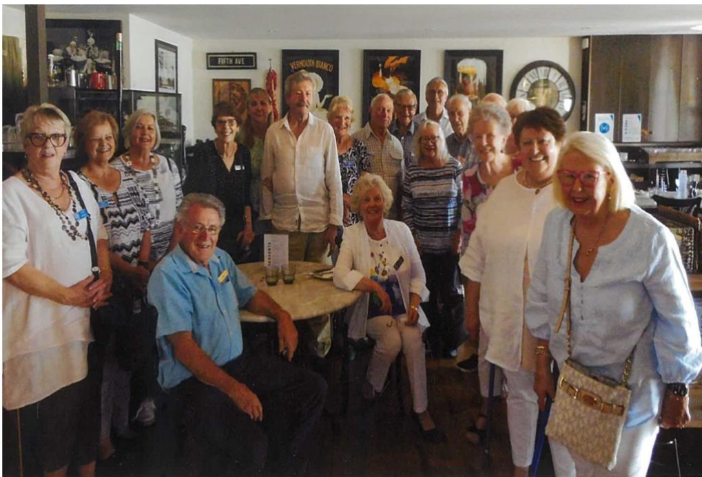
Happy Gathering at Manhattan for lunch on November 9. Mt Eliza and Mornington Probus

For all phone numbers, see Committee list on the front page. Payments to the Treasurer.