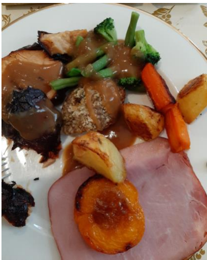
A full Christmas dinner, followed by Christmas Pud and Mince Pies!