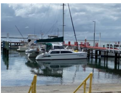
'Some of the wonderful places we visited during our stay at Foster'